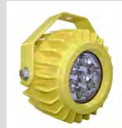
Cast aluminium housing