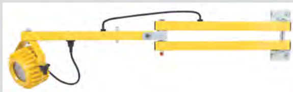
Crawford Dock Light Heavy Duty LED - with arm